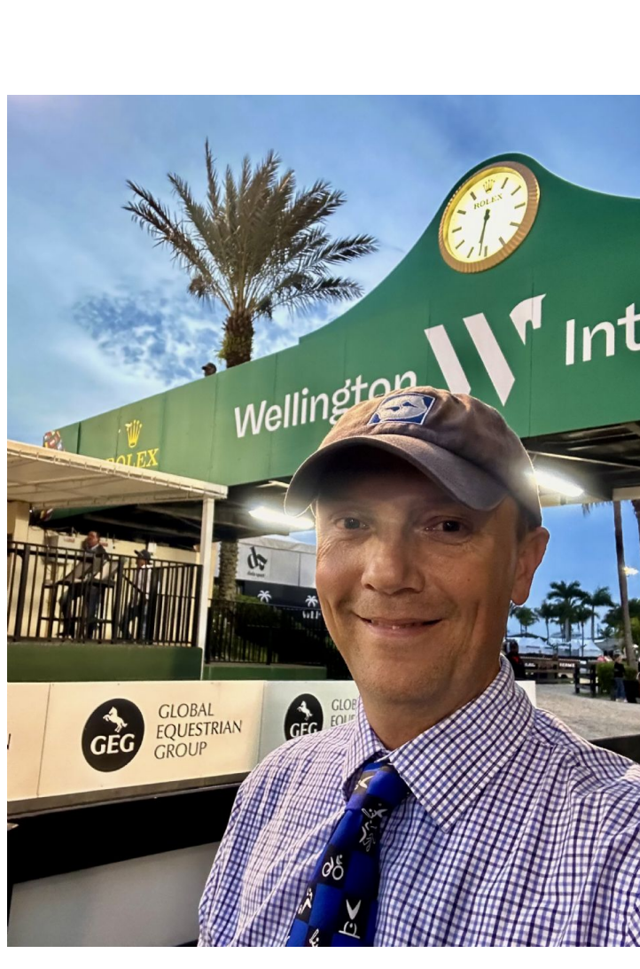
Palm Beach Equine Clinic is the official treating veterinarian for the Winter Equestrian Festival. 🎉 Congratulations to Team Ireland 🇮🇪 Team Canada 🇨🇦 and Team USA 🇺🇸 who prevailed as the Top 3 finishers in the Nations Cup! 🏆